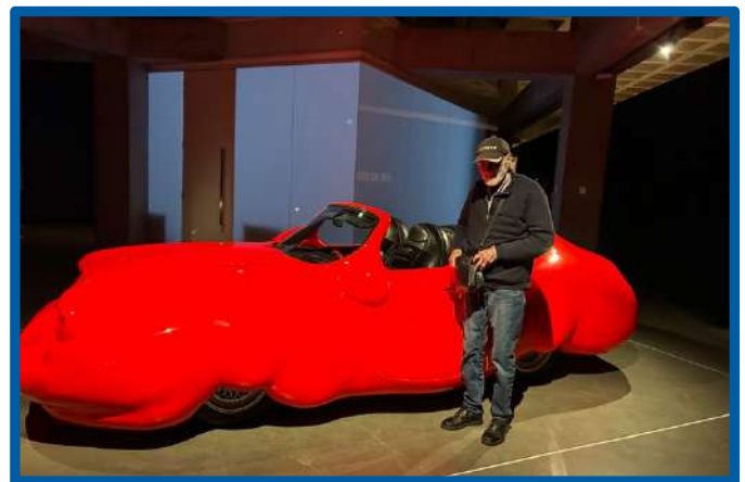
MONA (Museum of Old and New Art) - Fat Car Convertible