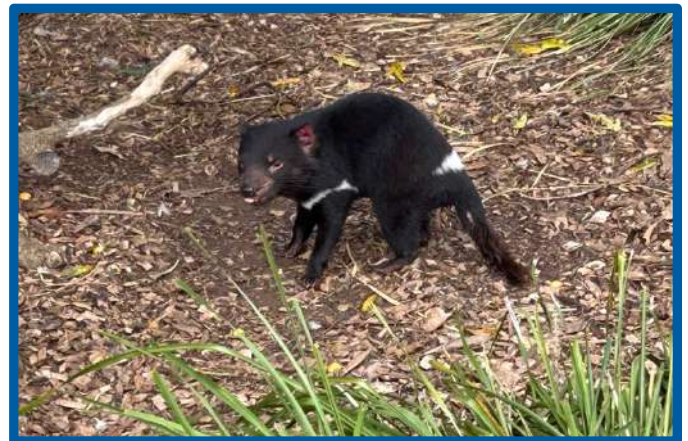
A cheeky Tasmanian Devil