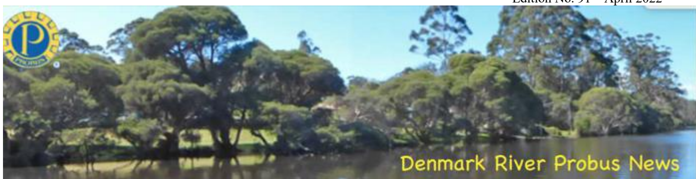
This newsletter is Private and Confidential for Probus use only and is not to be used for any other purpose.