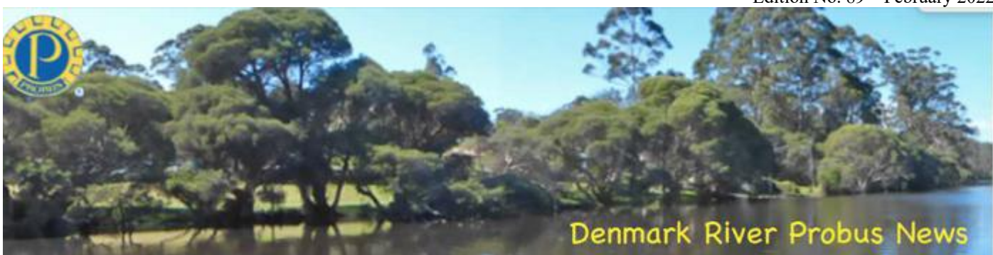
This newsletter is Private and Confidential for Probus use only and is not to be used for any other purpose.