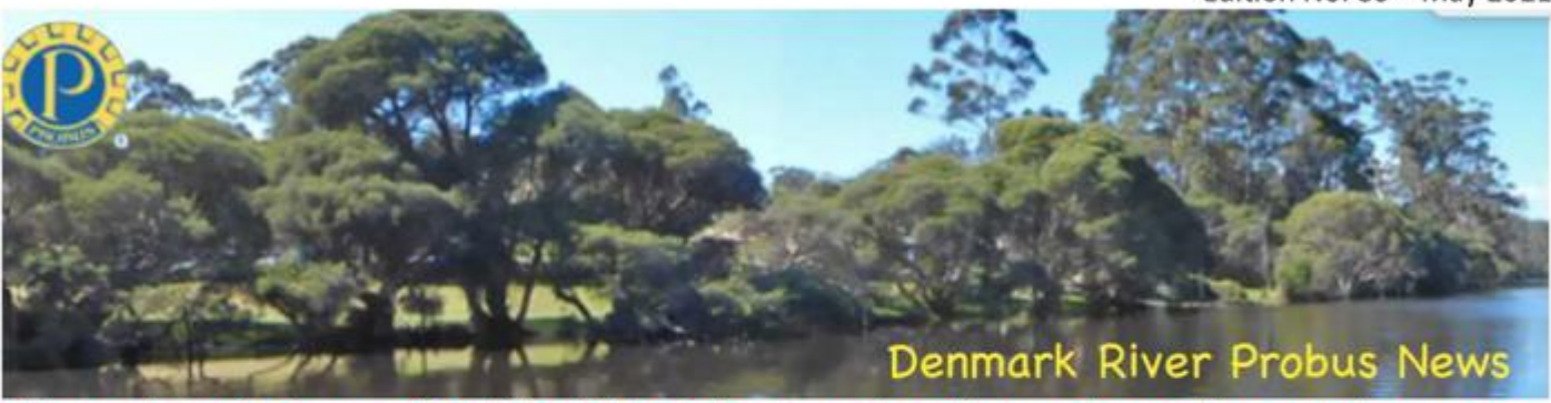
This newsletter is Private and Confidential for Probus use only and is not to be used for any other purpose.