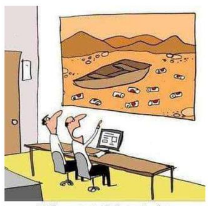
"There it is! There's the evidence Mars once had a lake!"