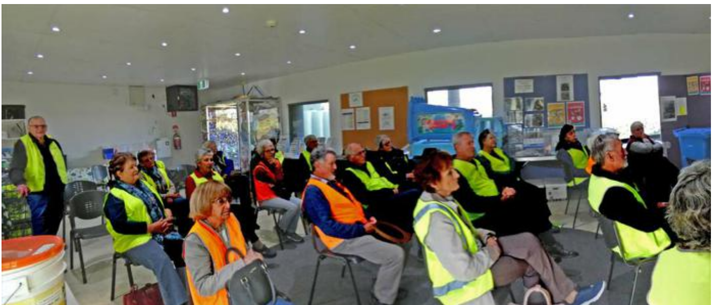
A group of attentive Probus members watching a video at the Albany Recycling Centre.