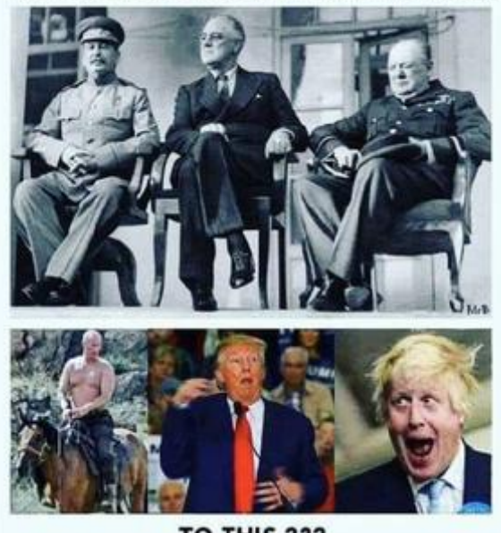
TO THIS ???