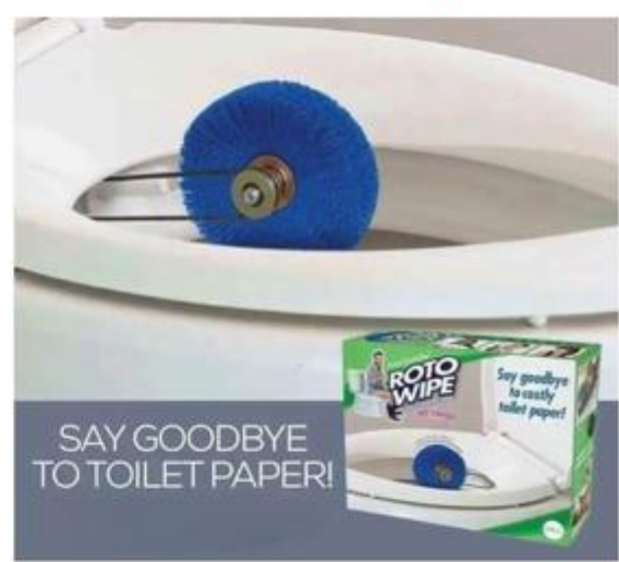
Ouch! That would be worse than newspaper.