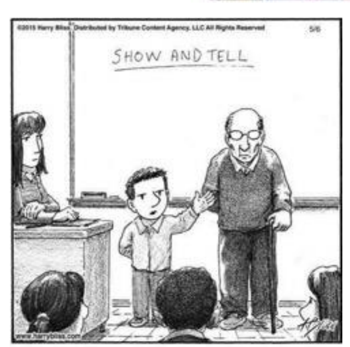
"This is my grandpa. He's going to explain why this country is going to hell in a handbasket."