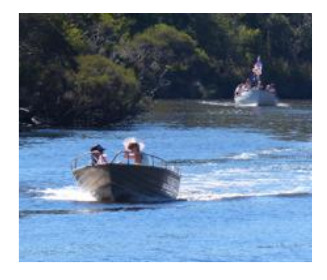
Denmark River Probus on the 21st?

and Mike's home for morning tea. Please bring a small plate of food to share in your backpack.