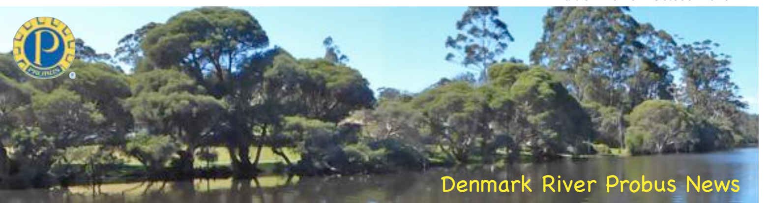
'This newsletter is Private and Confidential for Probus use only and is not to be used for any other purpose'