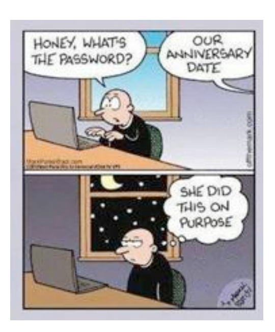
That's it folks.