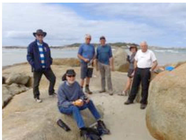
Probus Walk 02 Feb 2016