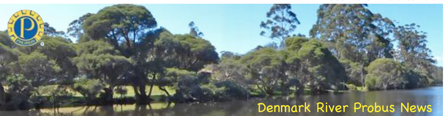
'This newsletter is Private and Confidential for Probus use only and is not to be used for any other purpose'