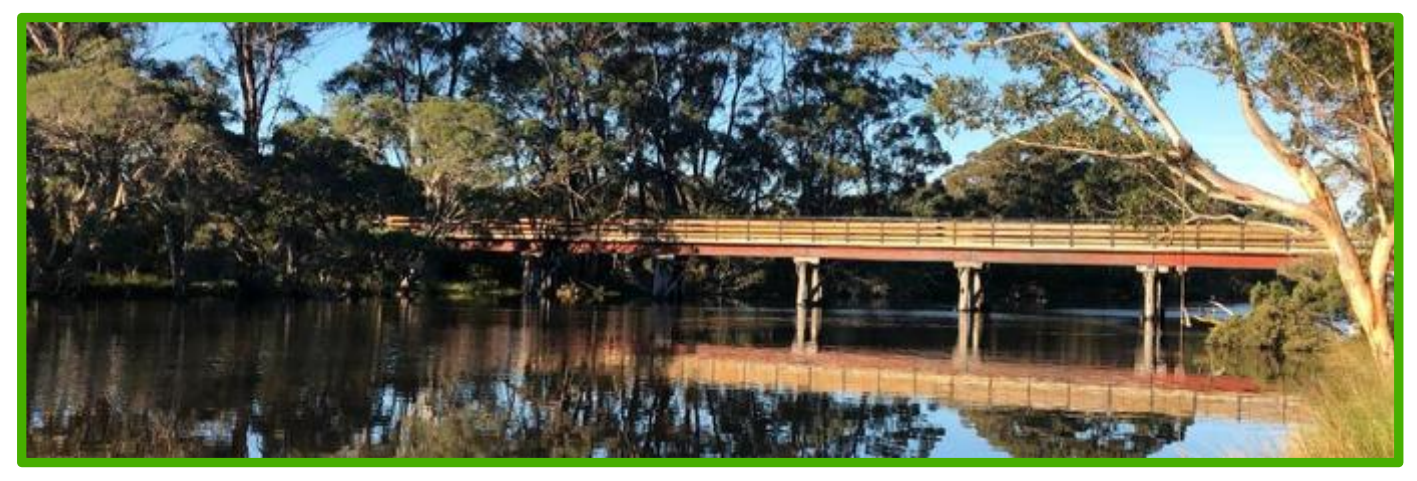
This newsletter is Private and Confidential for Probus use only and is not to be used for any other purposes.