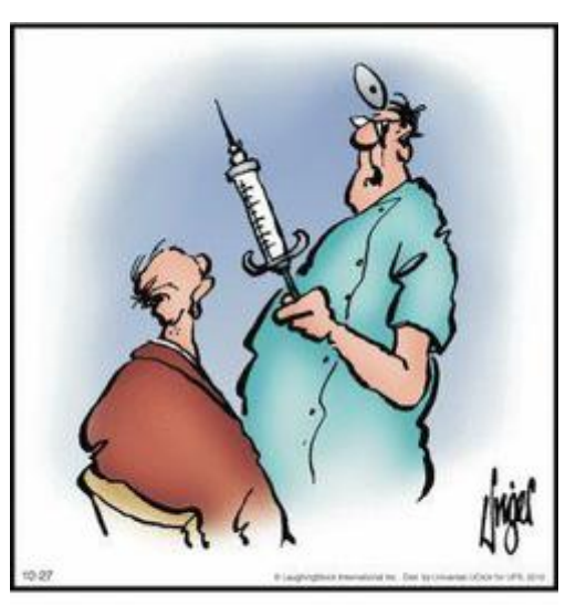
"This should keep you going while I'm on vacation."