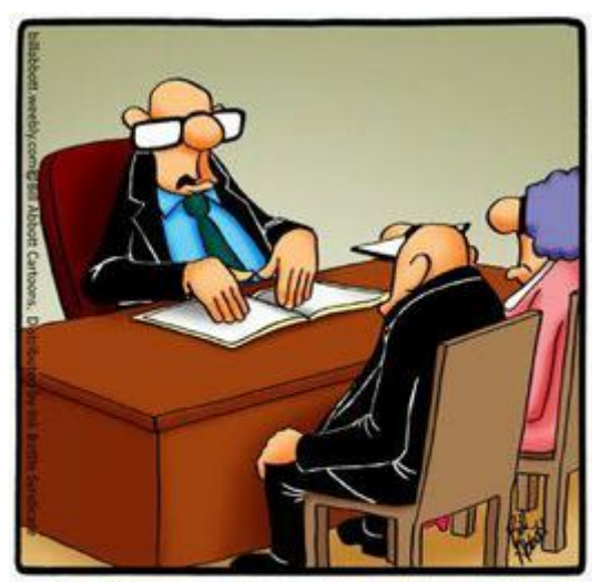
"I've crunched the numbers in your retirement account. It's time to figure out who will be wearing the mask and who will be driving the getaway car."

As usual. we didn't have a guest speaker for December. Eklektika came to entertain us instead.