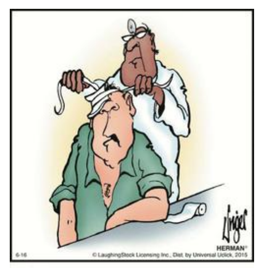
"So I said to her, 'How about giving me something to remember you by?""