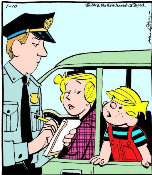
1-10 ©2018, North America Synd. "WE'RE ALREADY LATE... NOW MY MOM'LL HAFTA DRIVE EVEN FASTER!"