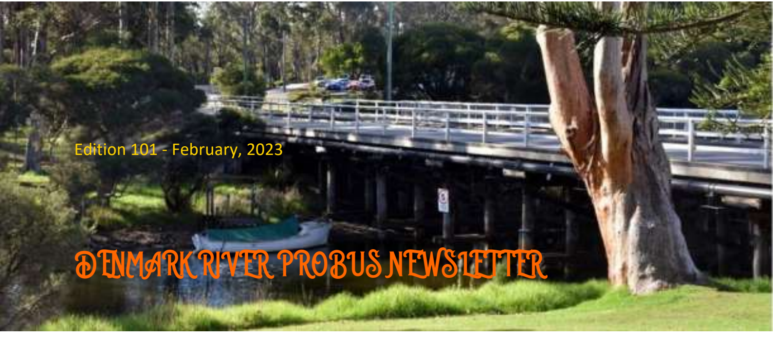
This newsletter is Private and Confidential for Probus use only and is not to be used for any other purpose.