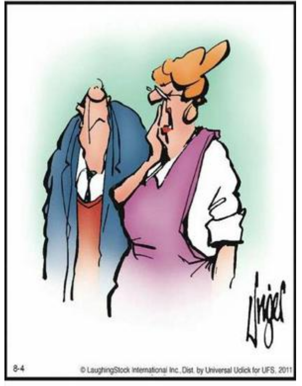
"What a coincidence! You forgot my birthday and I forgot how to cook."